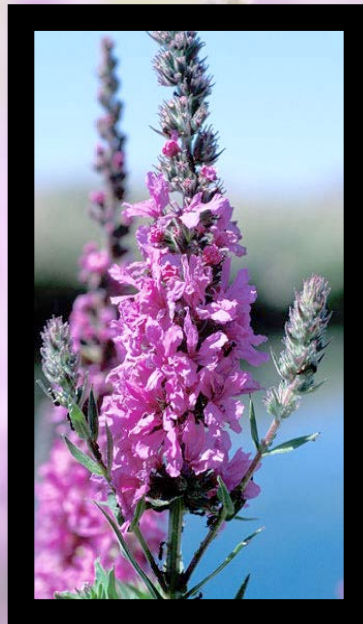
Purple Loosestrife in Bloom