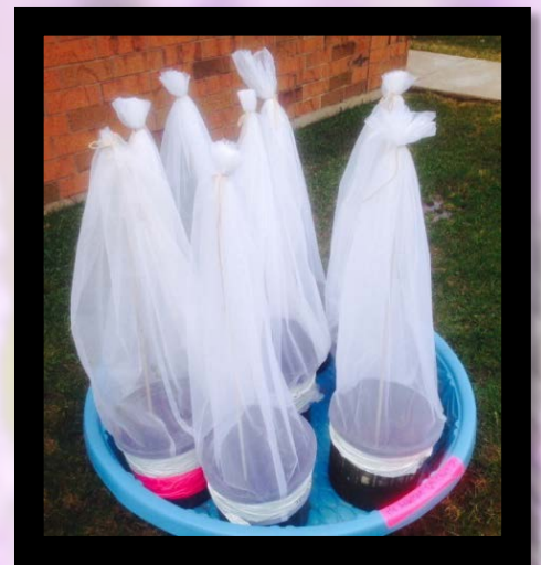
Net Enclosures for Beetle Rearing