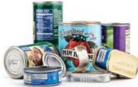
Food & Beverage Cans