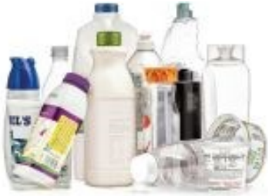
Plastic Bottles & Containers