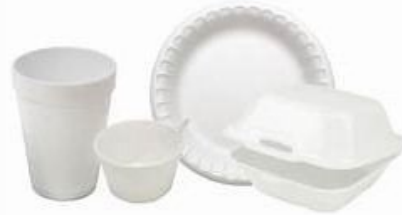
Food & Beverage Containers