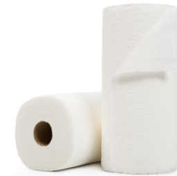
Paper Towels & Soiled Items