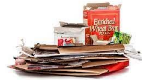
Paper, Flattened Cardboard & Paperboard