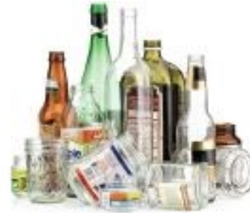
Glass Bottles & Containers