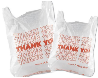
Plastic Bags & Containers